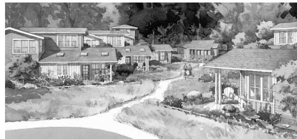
The chic and innovative homes at Chico Beach Cottages are sustainably designed with energy efficiency and green-building techniques.

All floor plans have main-floor master suites perfect for single-level living; second-floor suites might serve as the master instead, or be reserved for overnight guests. Home designs also boast bonus living space ideal for use as a home office, den or extra guest space. And the three-bedroom cottage is marked by an extraordinary tower loft with sweeping water views to inspire calm, creativity, or both!