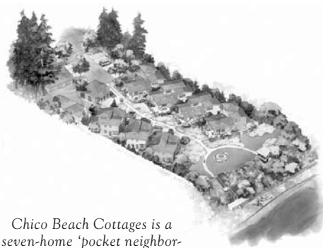
Chico Beach Cottages is a seven-home 'pocket neighborhood' complete with shared waterfront, common gardens and a community building for meetings or parties.