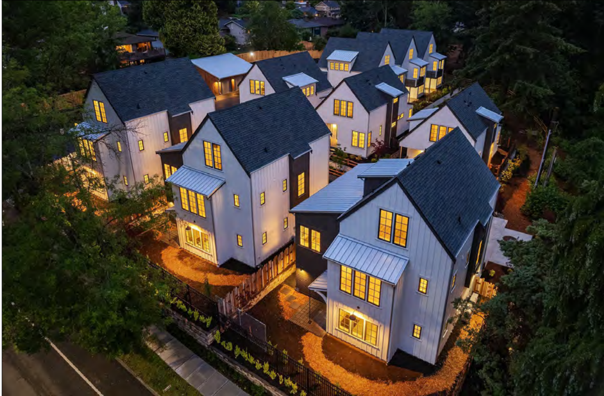
Thornton Creek Commons, Seattle WA